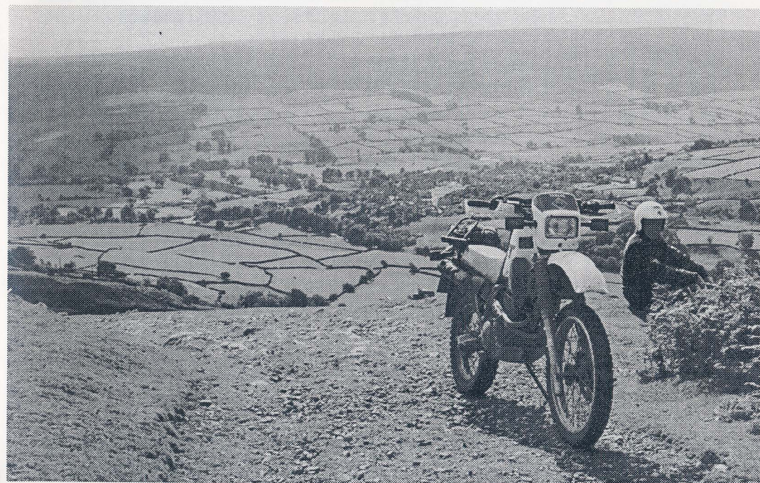
Relaxing on the Trail, Brompton-on-Swale, N. Yorkshire